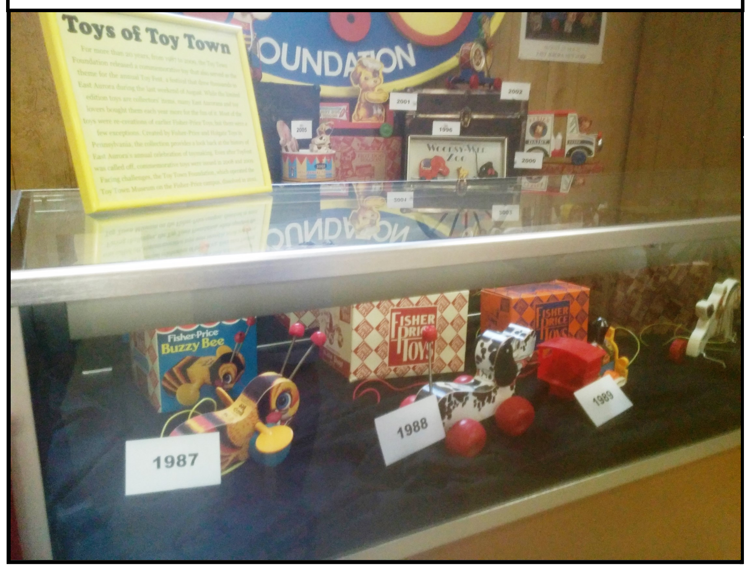
The Aurora Town Historian's exhibit at the Erie County Fair, in August 2016, "The Toys of Toy Town," featured ToyFest commemorative toys, from 1987 through 2009.