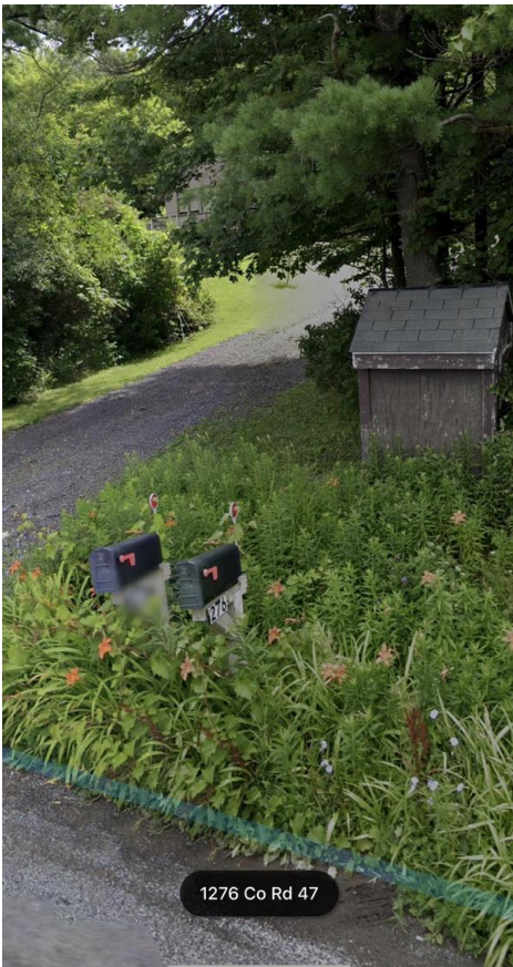
View of bus stop hut