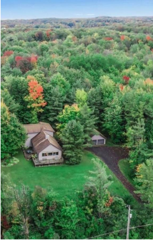
drone view of location