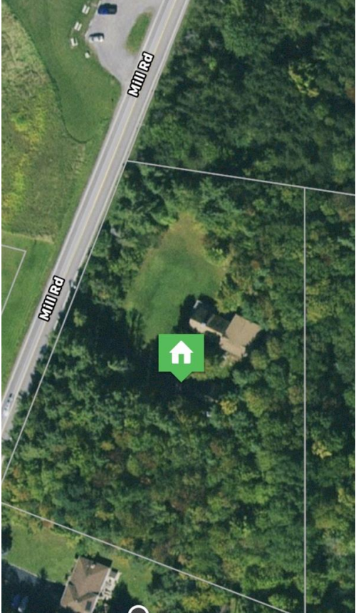
Satellite imagery with lot lines, as you can see the majority of the property is wooded. A formal survey will be available prior to submittal to town board. View of greenspace, building and driveway/parking