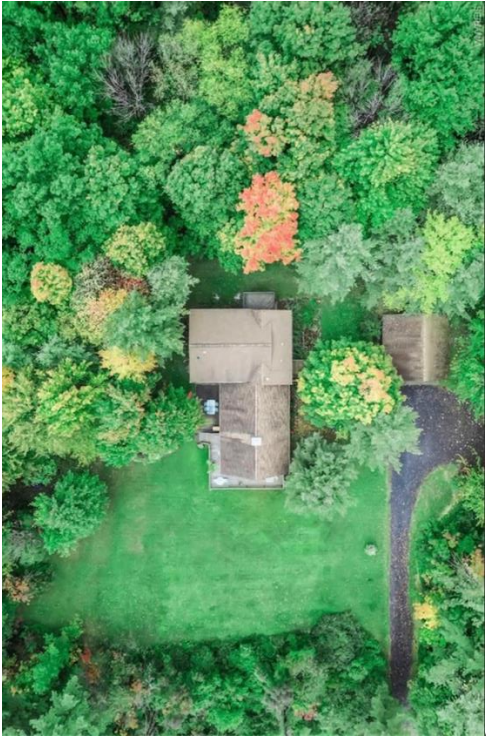
Arial view of building